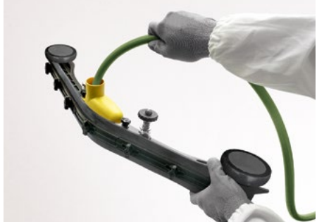
This increases machine efficiency and keeps its value high