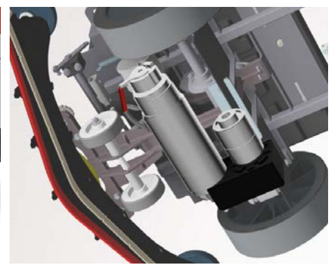
AUTOMATIC REDUCTION OF SPEED ON BENDS