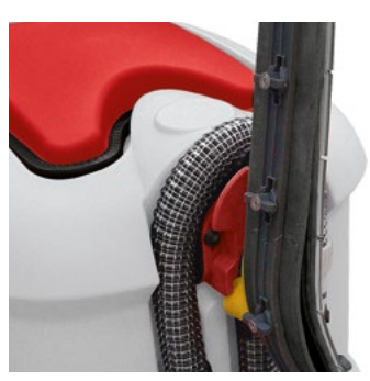
TOOL-HOLDER HOOK It can hold the squeegee, the brush or the tank lid, useful for machine store or maintenance