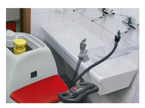
Quick filling of the solution tank