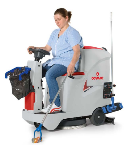
Can be customised with accessories to increase productivity