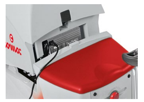
On request Innova 55 B can be equipped with on board battery charger, making battery charging easy, safe and