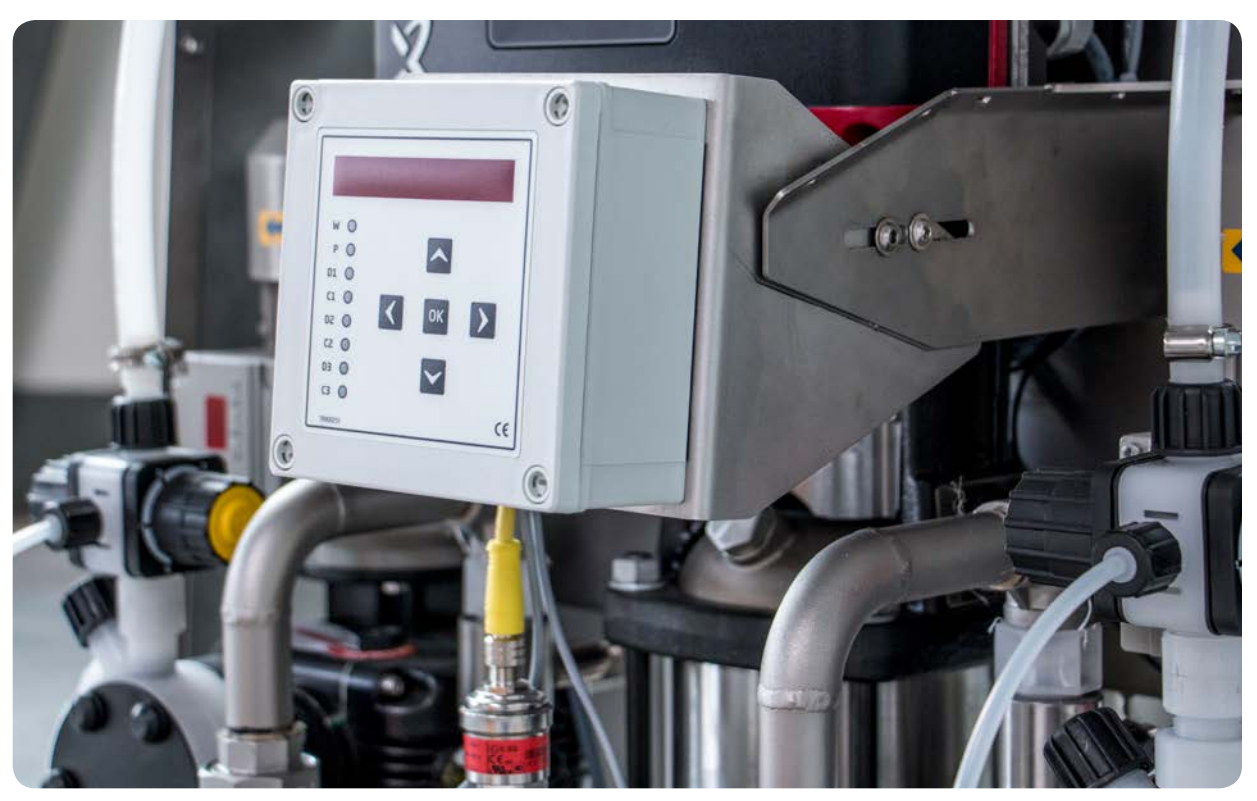
The CFD-Q 64E enables its users to foam and disinfect.