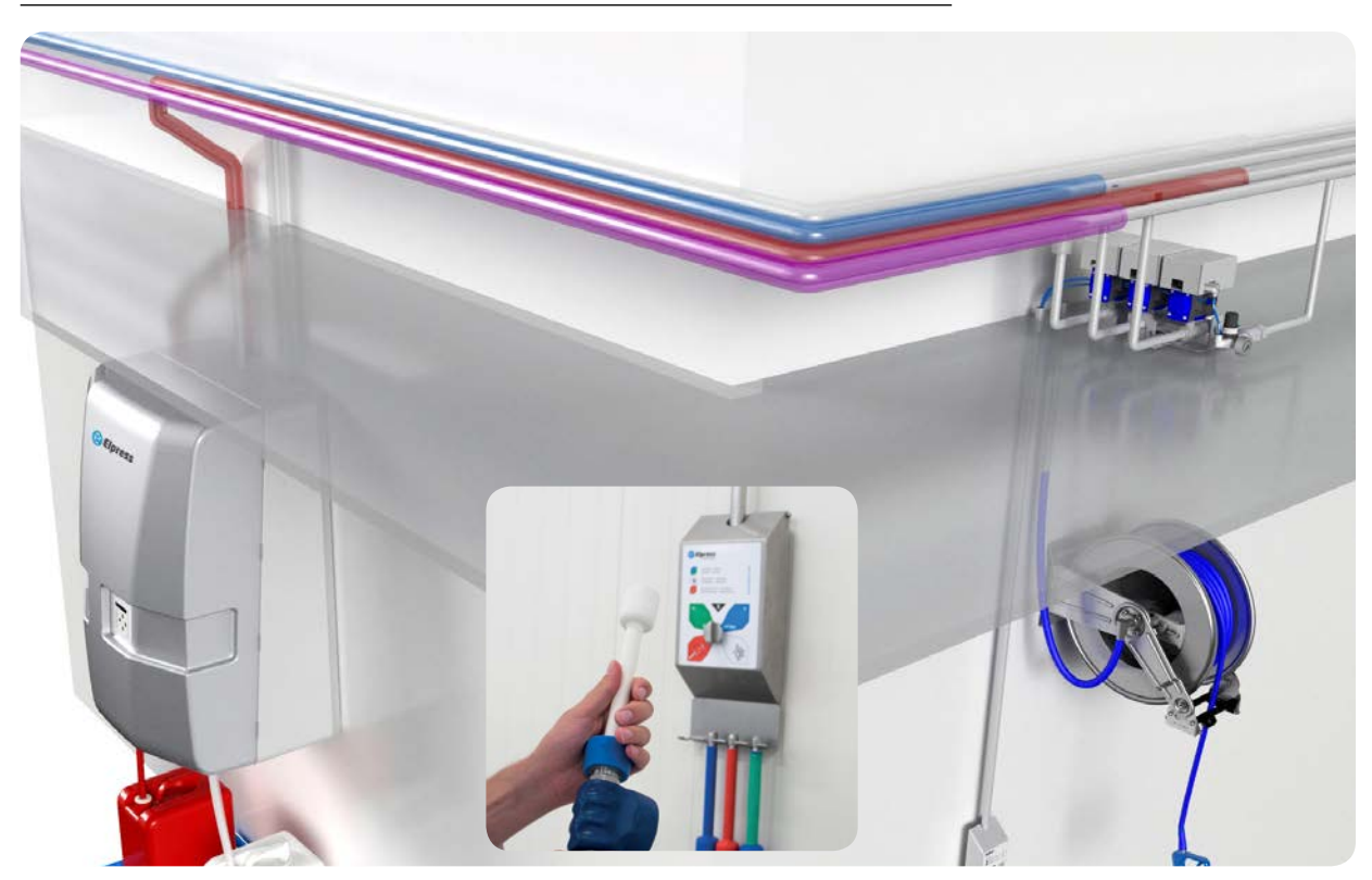
Control panel of satellite AC 45-B; the satellite is hidden away above the ceiling.