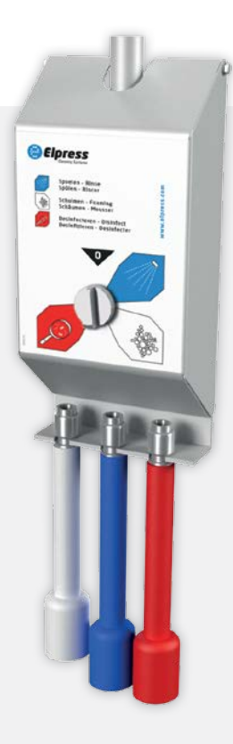
Control panel of the AC 45-B