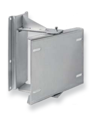
Swivel brackets Suitable for EHR reels.

All are made from high-quality stainless steel and are to be fixed to the wall.