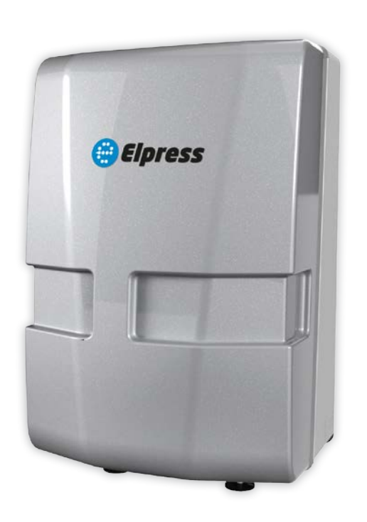
The LDC-Q 65/20 with optional stainless steel break tank.