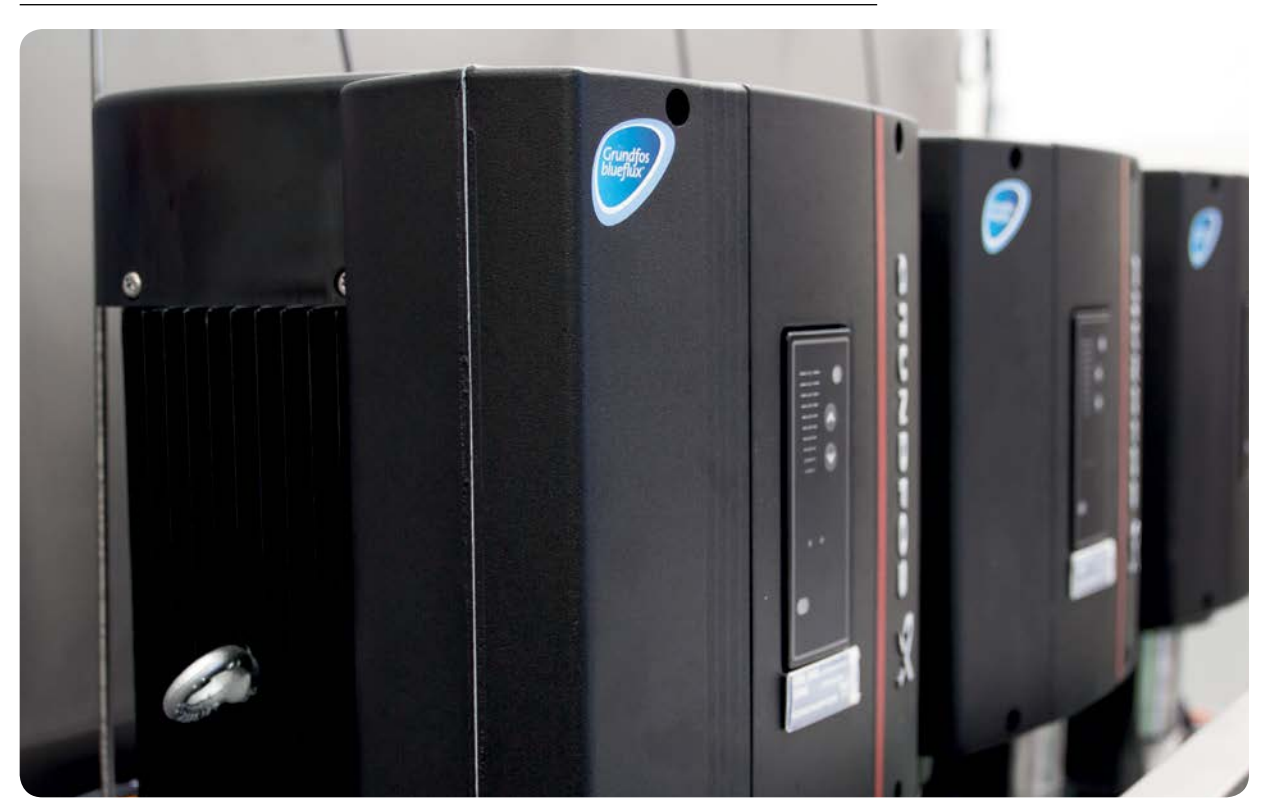
The LDC-Q 720/20 with three 11 kW pumps and optional break tank.