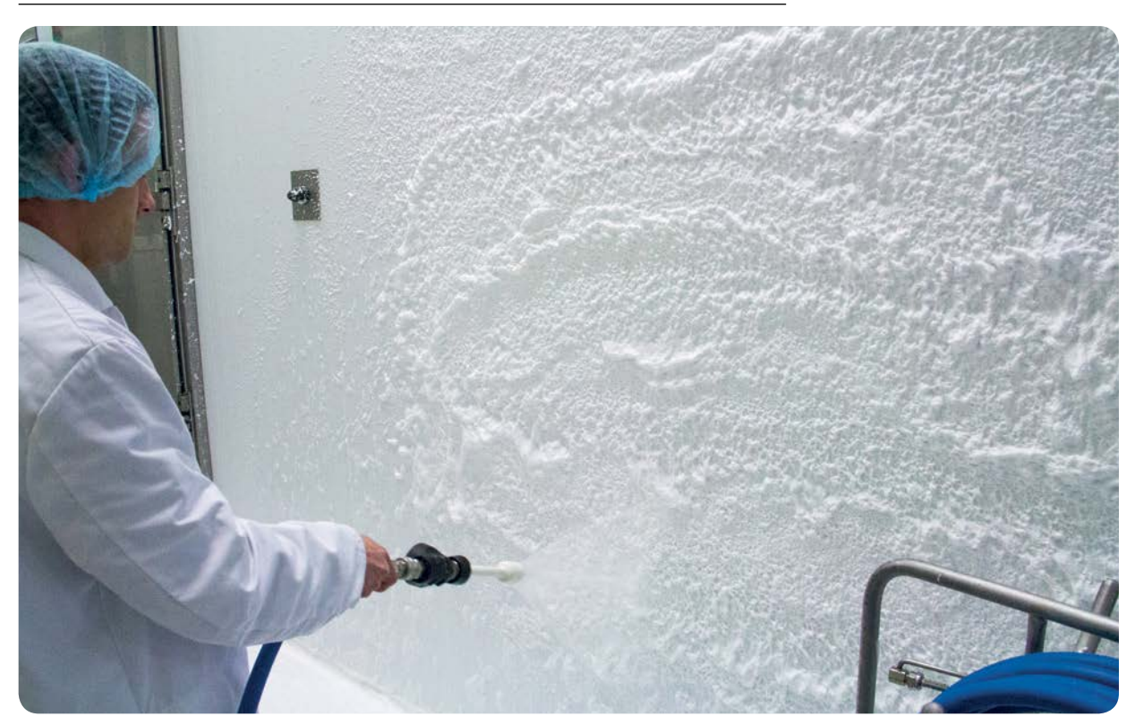
The DEFO in practice, excellent foam quality.