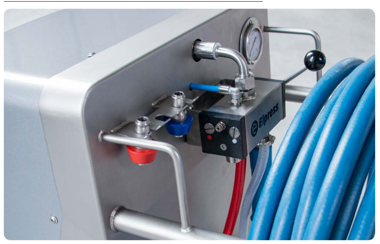
The control panel of the MLDC-RFD AIR - 2,2 kW..