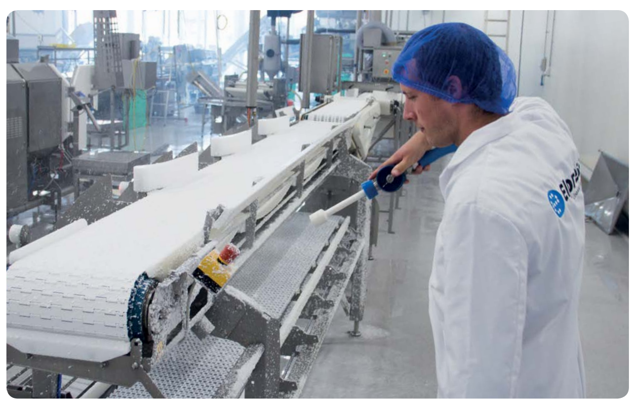
The CF-Q 6E enables up to 6 users to foam at the same time.