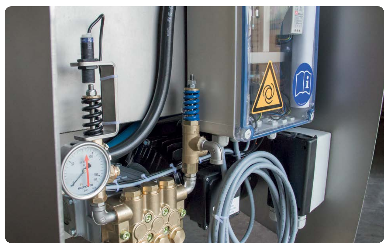
The inside of the of the WMRA 60/21.