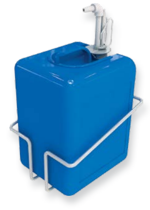
Jerrycan holder EJH20 made from stainless steel.

With two hooks for items such as a spray gun. Article number: 83701110