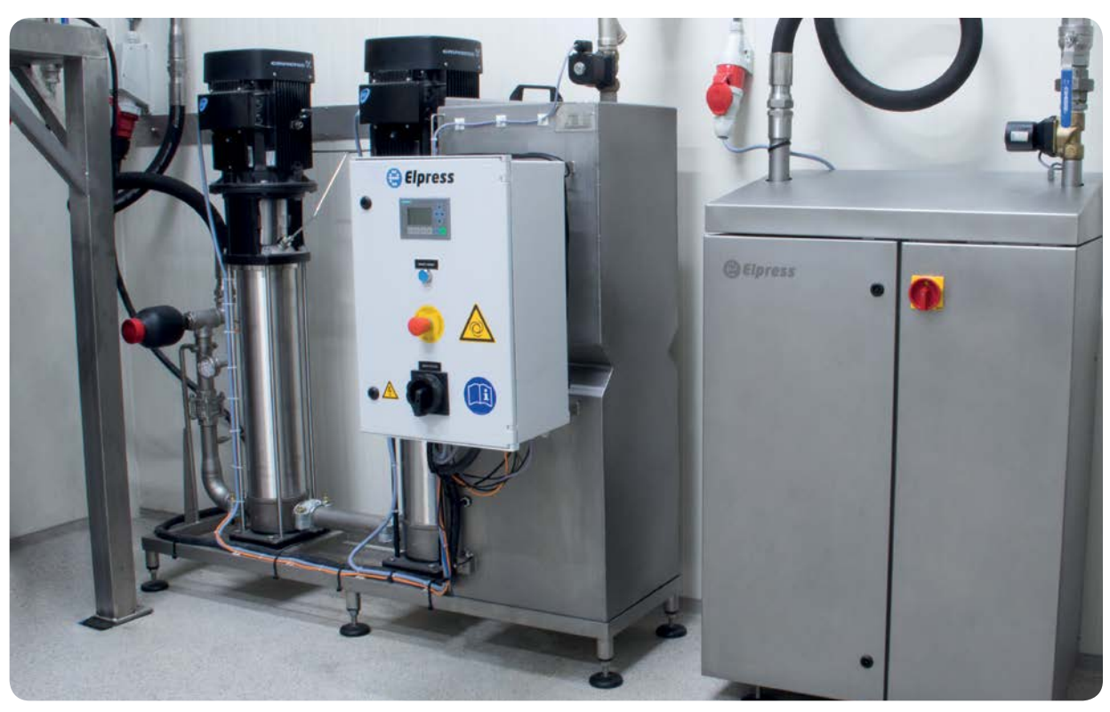
MDC 80/40 (left) next to an LDC-Q 100 with enclosure (right).