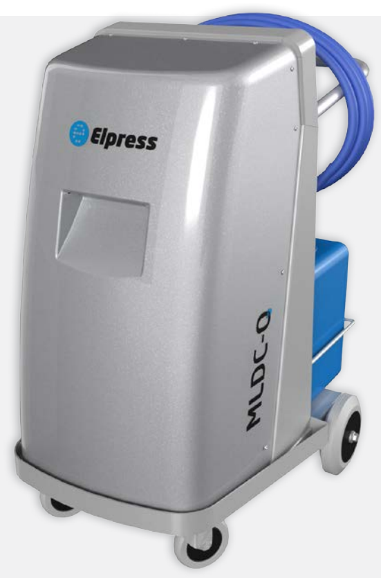
MLDC-Q RFD AIR - 2,2 kW