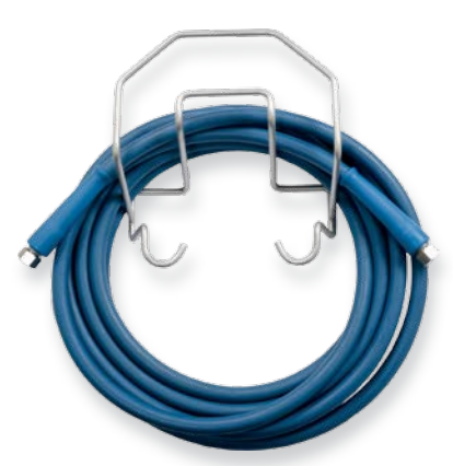
Hose holder made from stainless steel.

All are made from high-quality stainless steel and are to be fixed to the wall.