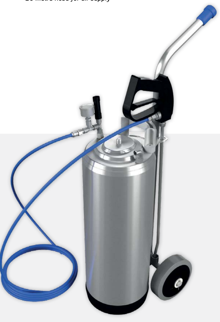
Disinfection tank MF-20