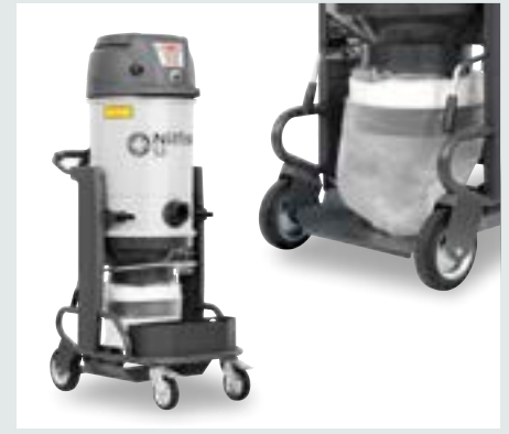
S3 with gravity unload system with Longopac®