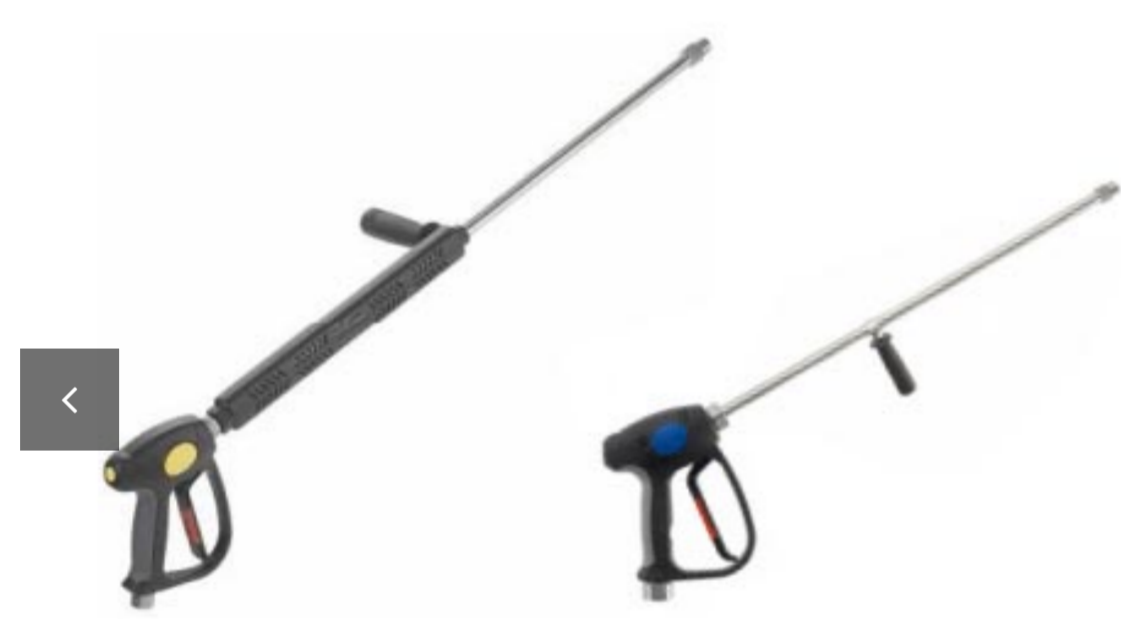
Guns with Lances