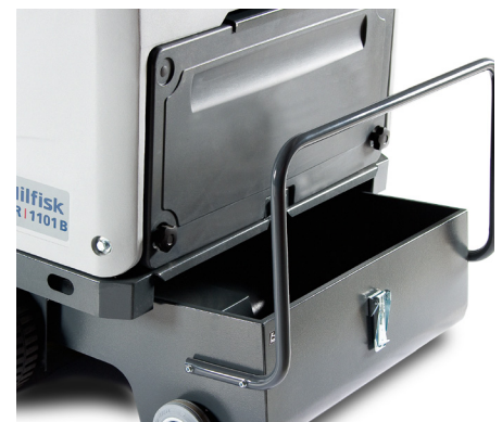
The hopper capacity is extremely large to extend operational time