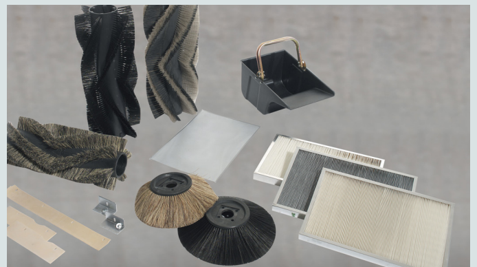
Large range of optional accessories provides the right tools for specific jobs e.g. carpet kit, special filters and brushes, overhead guard, 2x18 litres hopper containers etc.