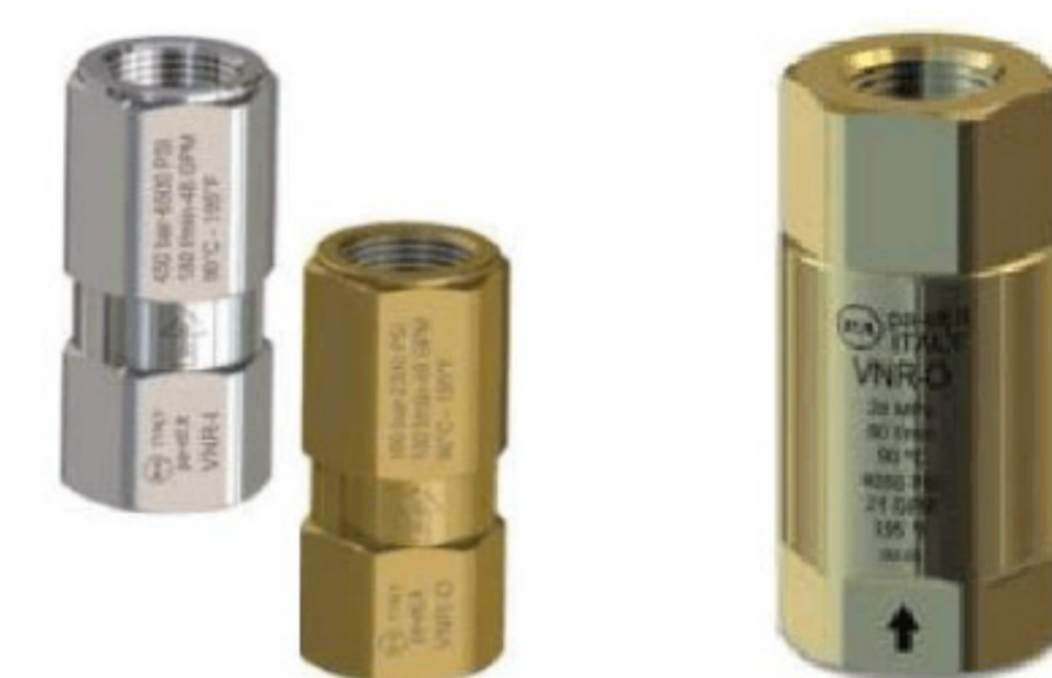
Non Return Valves